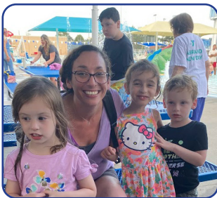
Photos from the Poolside Havdalah on Aug. 12

The Weiner Religious School will have a booth with a Henna tattoo artist! Come check us out.