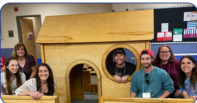
Day of Discovery Faculty Photo!