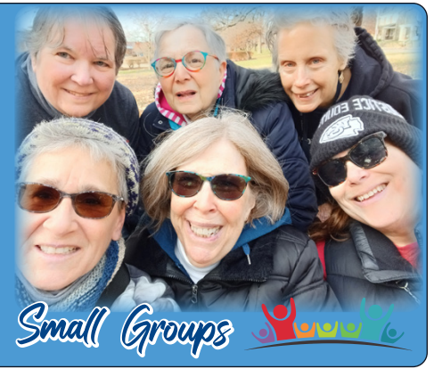
Photo taken during the group's walk on December 10 at the Kauffman Legacy Park and Anita Gorman Conservation Center.