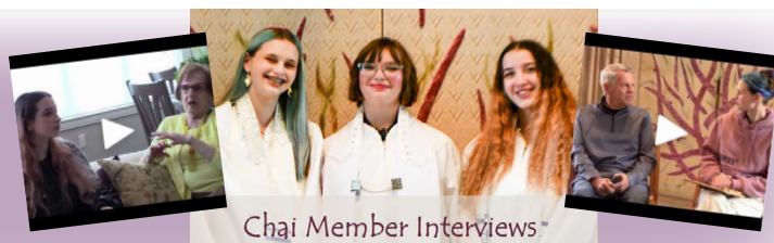
Chai Member Interviews

https://beth-torah.org/chai-member-interviews